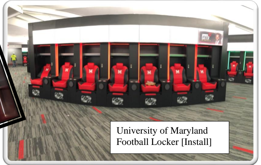
University of Maryland Football Locker [Install]

Please visit Imagination Millwork's Website or contact our Sales' Department at 301-874-1160 Ext 1 to discuss your next project.