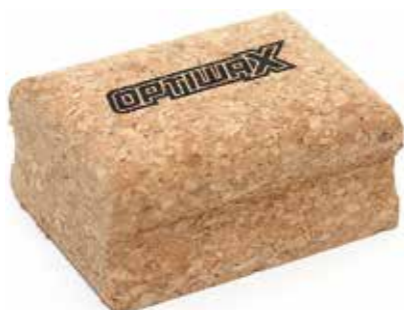
Optiwax Natural Cork Product No. 70090008