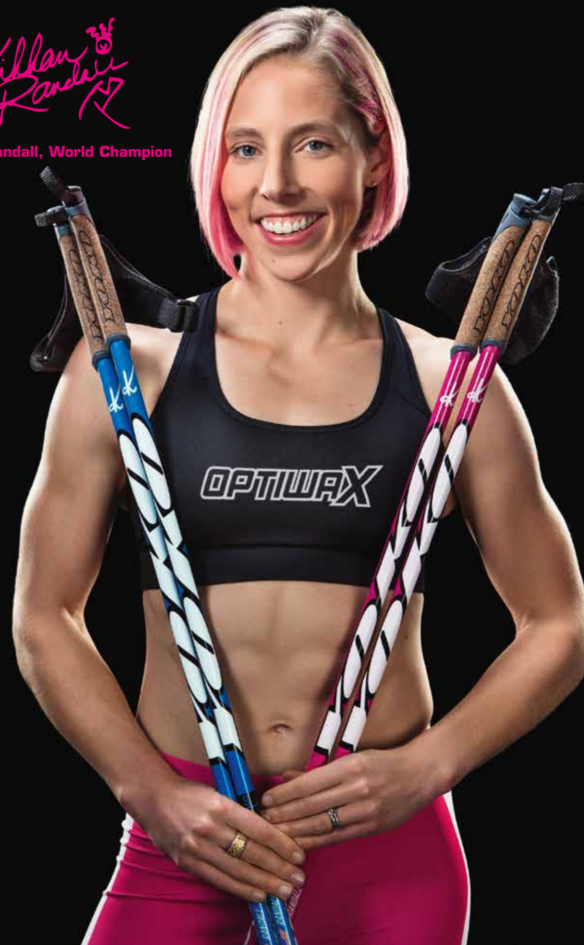
Kikkan Randall, World Champion