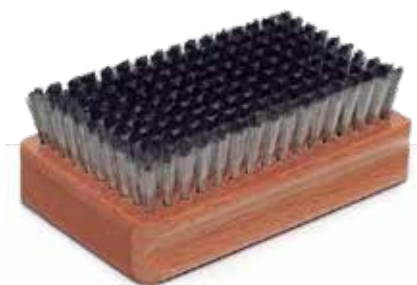
Brush Fine Steel Product No. 70090005