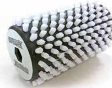
Roto Brush Hard Nylon Product No. 70090010