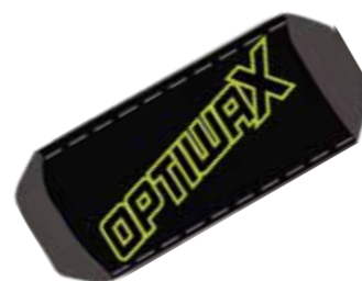
Ski Tie Product No. 80090003