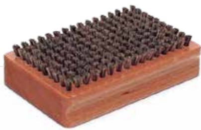
Brush Horse Hair Product No. 70090003