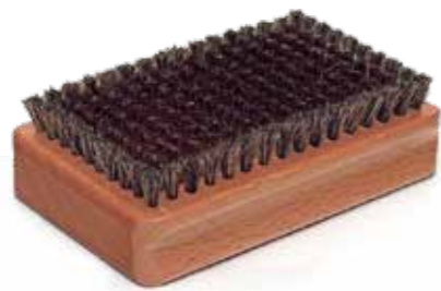
Brush Brass Product No. 70090004