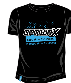
T-shirt, black Product No. 8310001