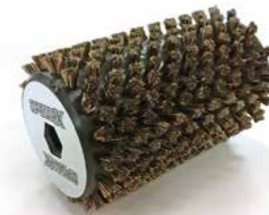
Roto Brush Horse Hair Product No. 70090011