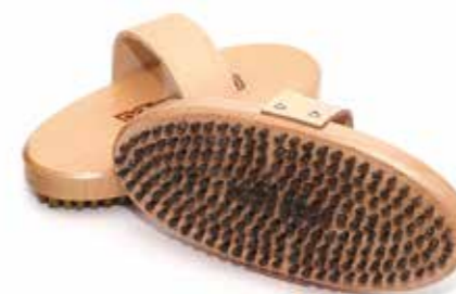
Roto Brush Hard Nylon Product No. 70090010