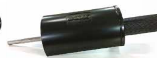
Roto Brush Handle 200mm Product No. 70090013