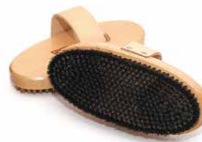
Roto Brush Handle 100mm Product No. 70090012