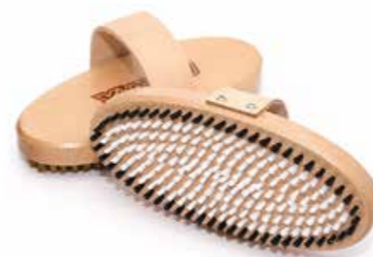
Roto Brush Soft Nylon Product No. 70090009