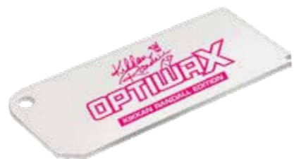
Scraper Kikkan Product No. 71090006