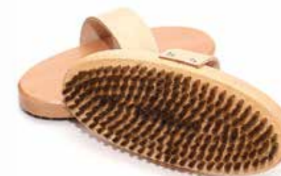
Roto Brush Horse Hair Product No. 70090011