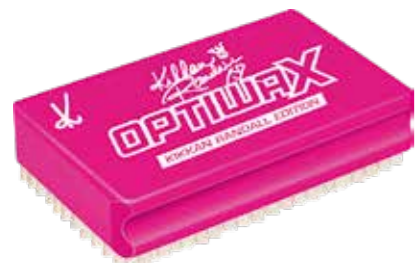
Brush Nylon Hard Kikkan Product No. 71090001