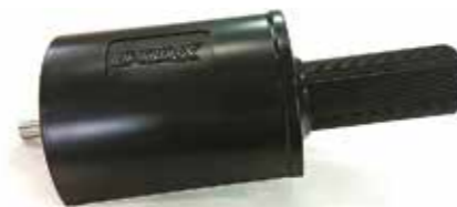
Roto Brush Handle 100mm Product No. 70090012