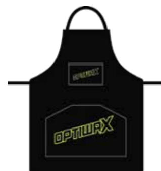
Wax Apron Product No. 80090008