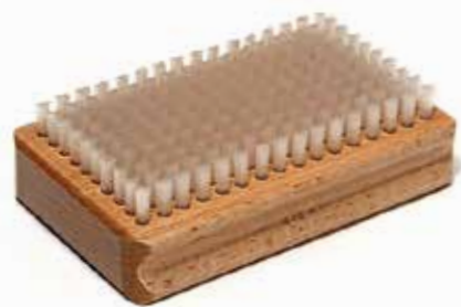
Brush Nylon Hard Product No. 71090001