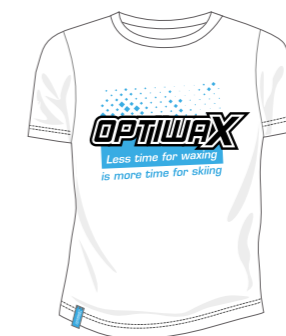
T-shirt, white Product No. 8300001