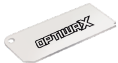
Scraper Product No. 70090006