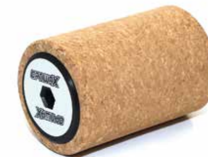
Optiwax Roto Cork Product No. 70090014