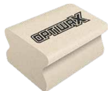
Optiwax Synthetic Cork Product No. 70090007