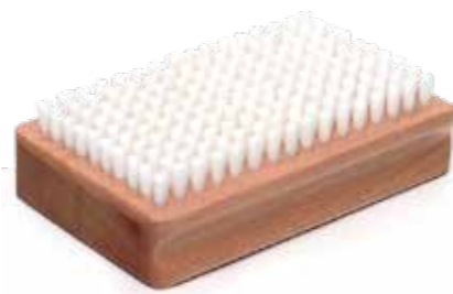
Brush Nylon Product No. 70090002