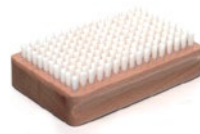
BRUSH NYLON Product No 70090002