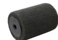
ROTO SPEEDTEX Product No 70090023