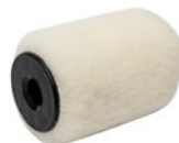
ROTO MERINO WOOL Product No 70090022