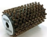
ROTO BRUSH HORSE HAIR Product No 70090011