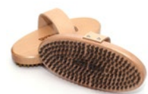
BRUSH HORSE HAIR OVAL Product No 70090016