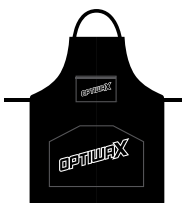
WAX APRON Product No 80090008