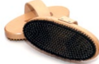
BRUSH FINE STEEL OVAL Product No 70090018