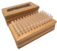
BRUSH NYLON/ CORK Product No 70090021