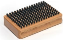
BRUSH HORSE HAIR Product No 70090003