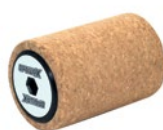
ROTO CORK Product No 70090019