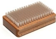
BRUSH NYLON HARD Product No 70090001