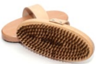
BRUSH BRASS OVAL Product No 70090017