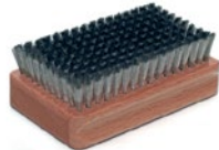
BRUSH FINE STEEL Product No 70090005