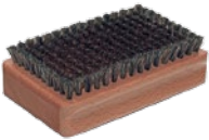
BRUSH BRASS Product No 70090004