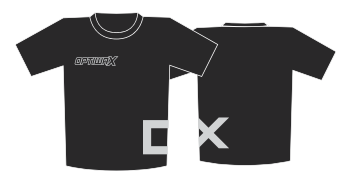
OPTIWAX T-SHIRT BLACK Product No 8310001