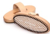
BRUSH NYLON HARD OVAL Product No 70090015