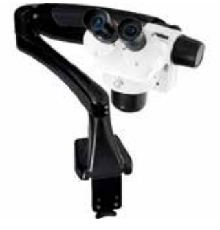
Z4 Zoom on Pneumatic Arm