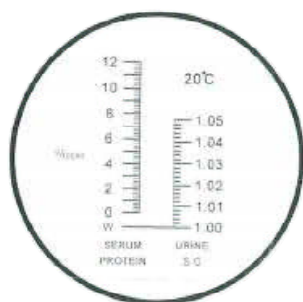
Protein / Specific Gravity Scale