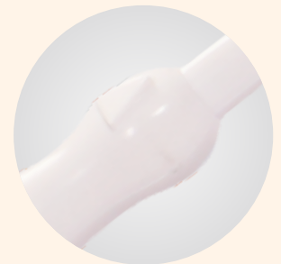
Orientation arrow on hub