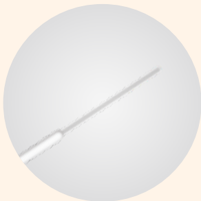
Soft inner catheter and smooth tip