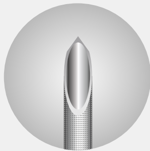
Tri-facet geometry with highly echogenic tip