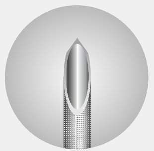
Tri-facet geometry with highly echogenic tip