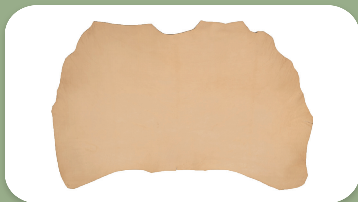
DOUBLE SHOULDER TRIMMED