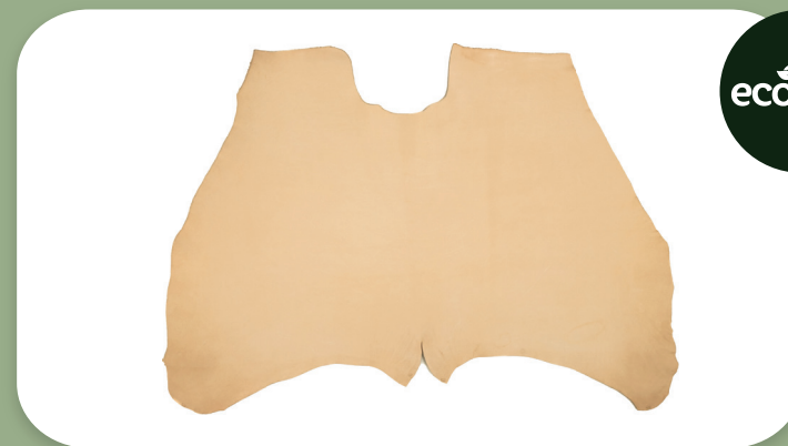
DOUBLE SHOULDER UNTRIMMED