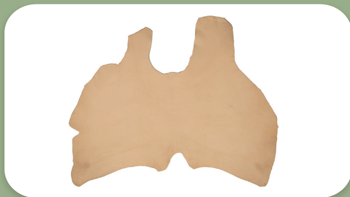
DOUBLE SHOULDER UNTRIMMED