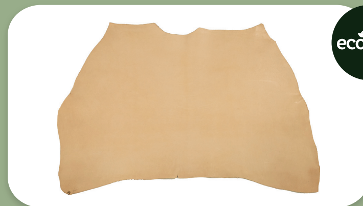
DOUBLE SHOULDER TRIMMED