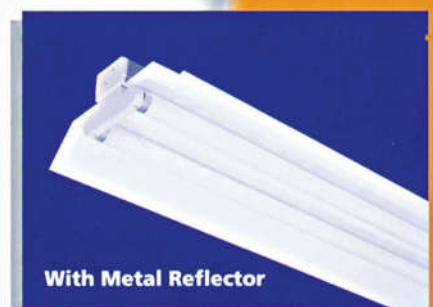
With Metal Reflector