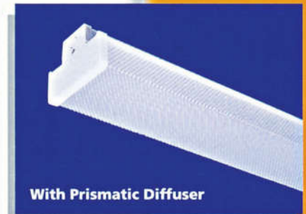
With Prismatic Diffuser