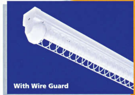
With Wire Guard