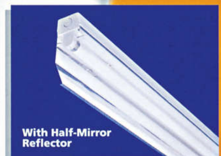
With Half-Mirror Reflector