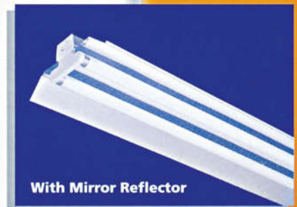
With Mirror Reflector