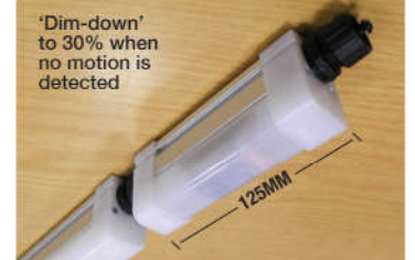
With 'Plug-on' dim-down microwave sensor