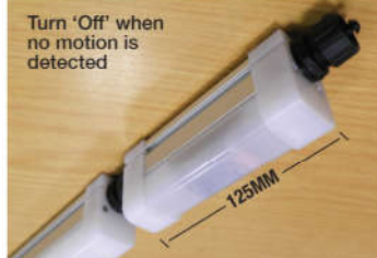
With 'Plug-on' ON/OFF microwave sensor