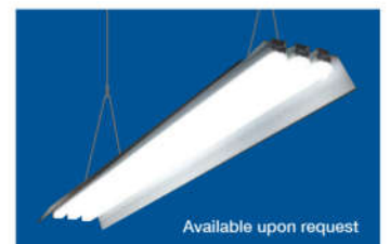
Available upon request