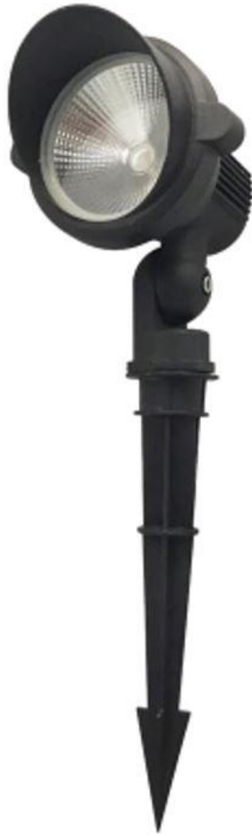
Spike Light Spotlight