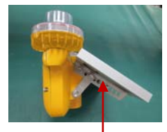
Bracket of angle adjustment