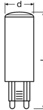
PARATHOM LED PIN 4.8 W/827 G9