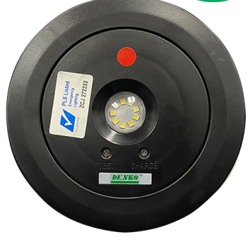
EmLED-12NM (B) with large ring adapter