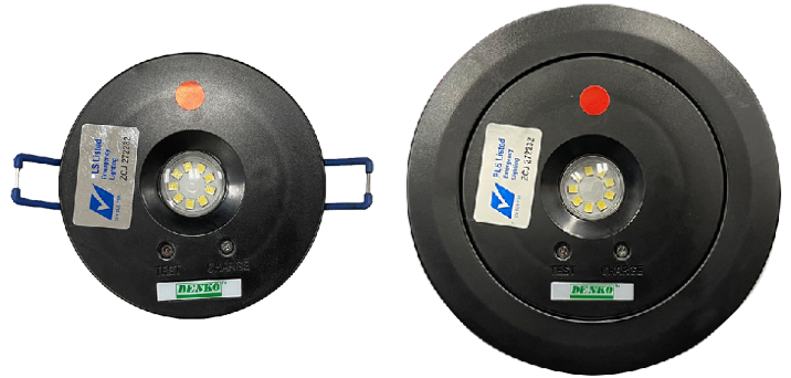
EmLED-12NM (B) EmLED-14NM (B)