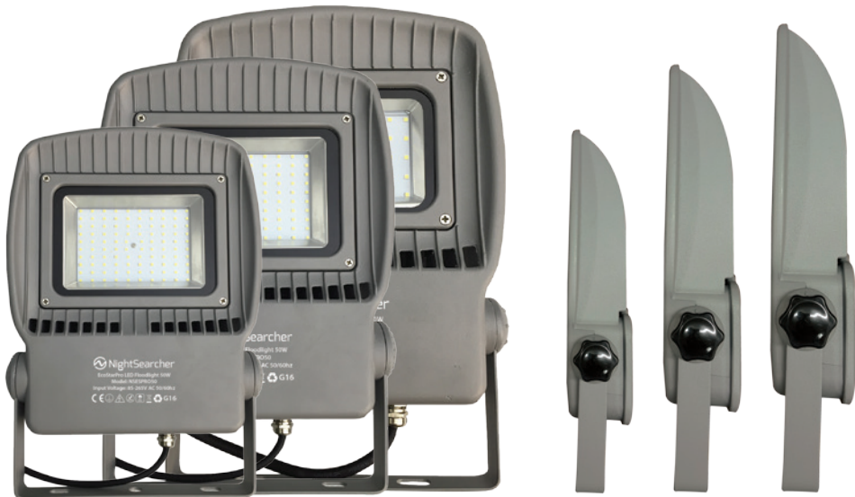
ECOSTAR PRO 30W • 50W • 100W

The extraordinary efficiency and performance over halogen means huge savings in running costs, they can be powered from long cable runs and off very small (1Kva) generators. They are IP65 rated for use in all weather conditions and the LED generates minimal heat so there is no cool down time required before they can be safely stowed away.