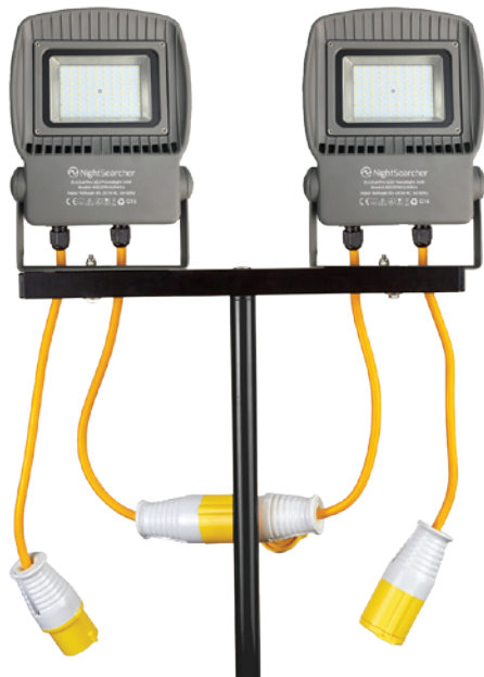
LINKABLE ECOSTAR PRO 30W, 50W + 100W