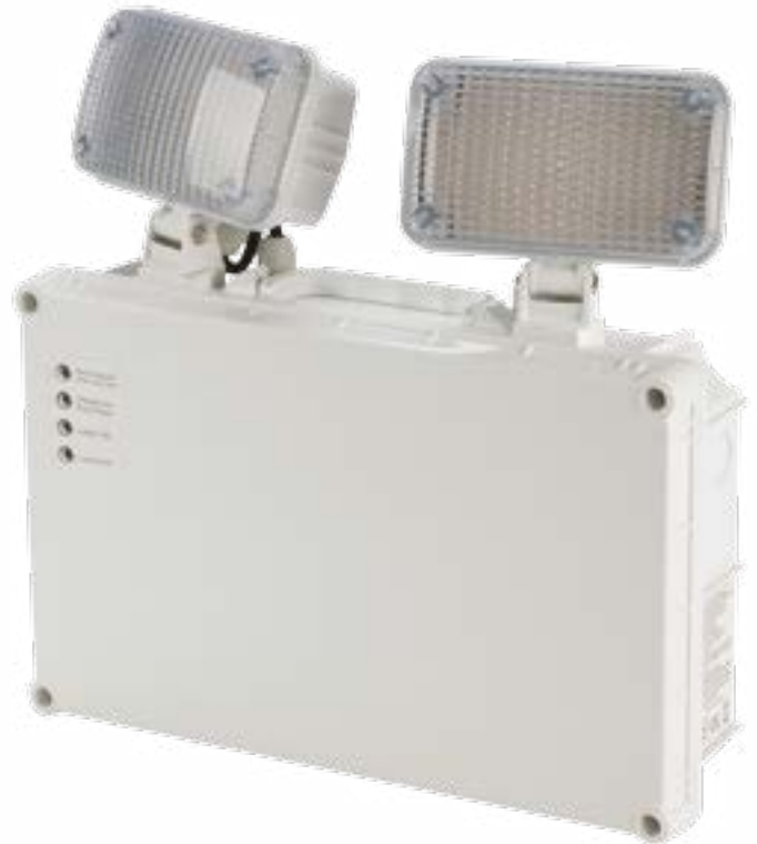
2 x 3W COMBINED BODY AND HEADS FOR USE FROM 0°C - +40°

Twinspot LED IP65 fittings for standard and cold-store applications