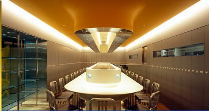
LED Utility Strip