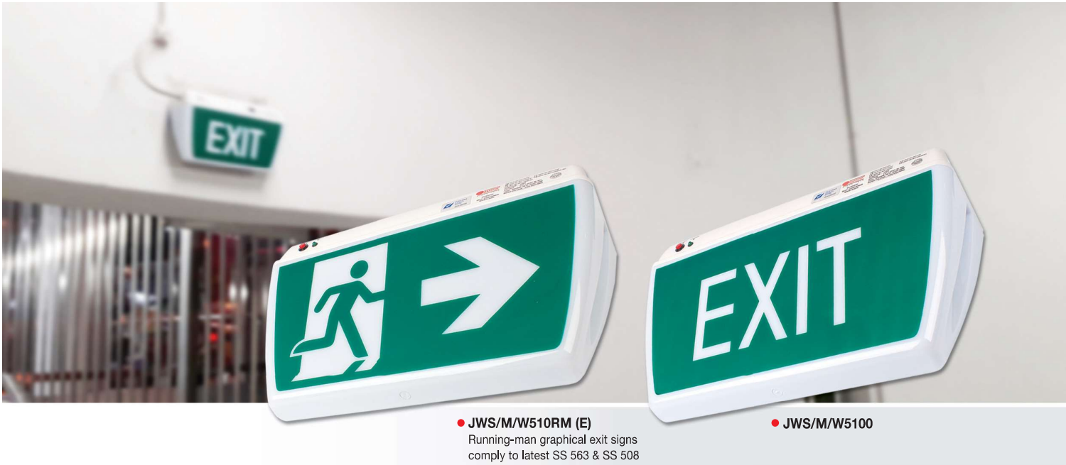
● JWS/M/W510RM (E) Running-man graphical exit signs comply to latest SS 563 & SS 508

SMT LED with lifespan 50,000 burning hours Indoor, outdoor, corrosion resistant weatherproof emergency exit light