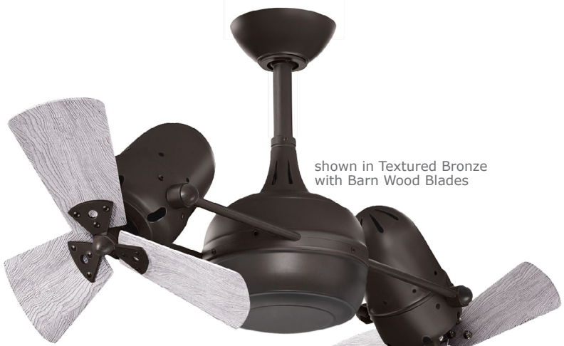
shown in Textured Bronze with Barn Wood Blades