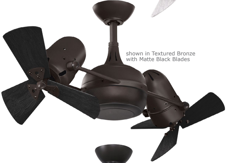
shown in Textured Bronze with Matte Black Blades