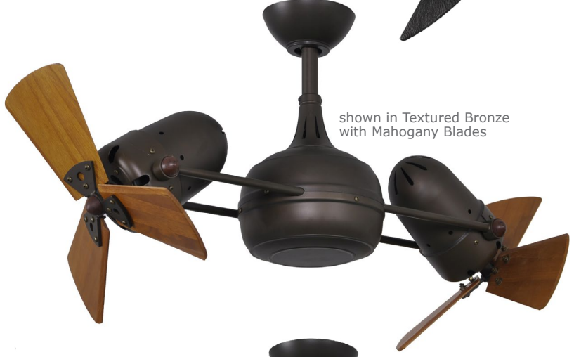
shown in Textured Bronze with Mahogany Blades