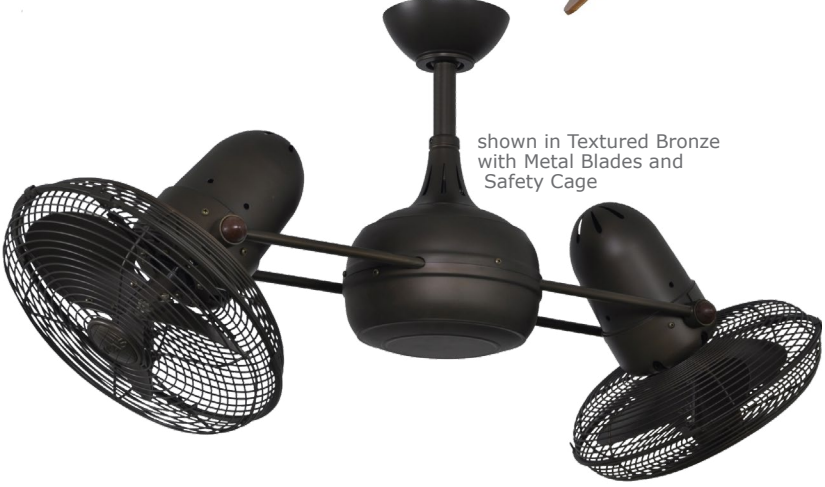
shown in Textured Bronze with Metal Blades and Safety Cage