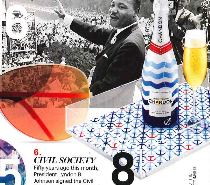
Martin Luther King Jr. at 1963's March on Washington.

What you need to do, see, and talk about this month