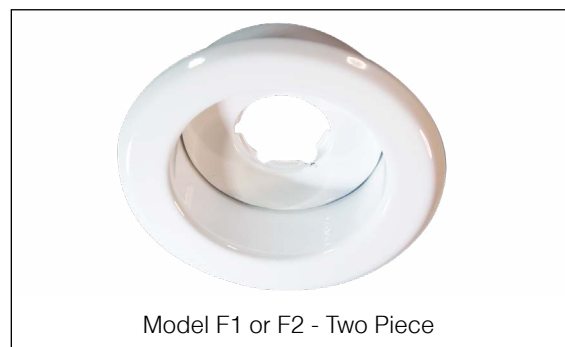
Model F1 or F2 - Two Piece