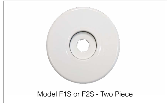
Model F1S or F2S - Two Piece