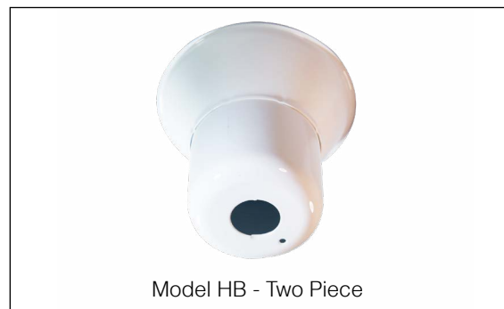
Model HB - Two Piece