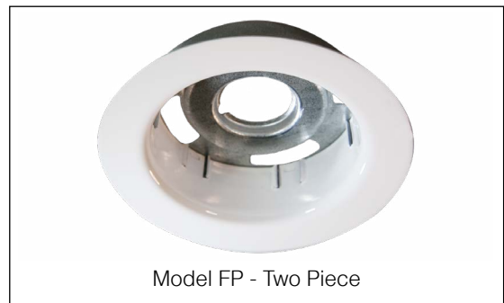
Model FP - Two Piece

Caution: The Model FP escutcheon is not intended for use where the space above the ceiling is positively pressurized with respect to the occupied space below.