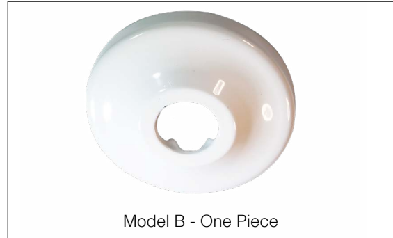
Model B - One Piece