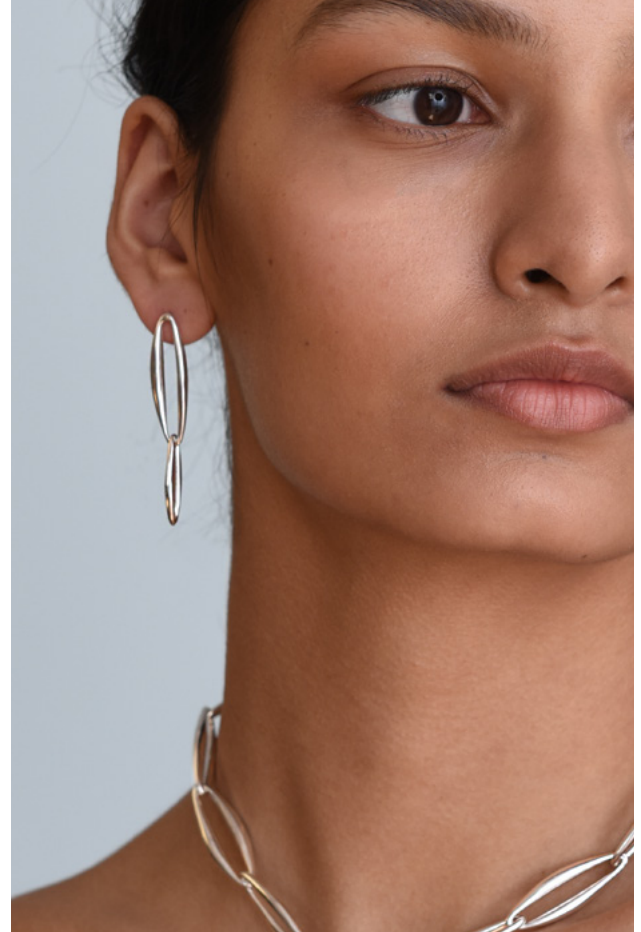
Lineage Chain Earrings - Sterling silver and gold vermeil