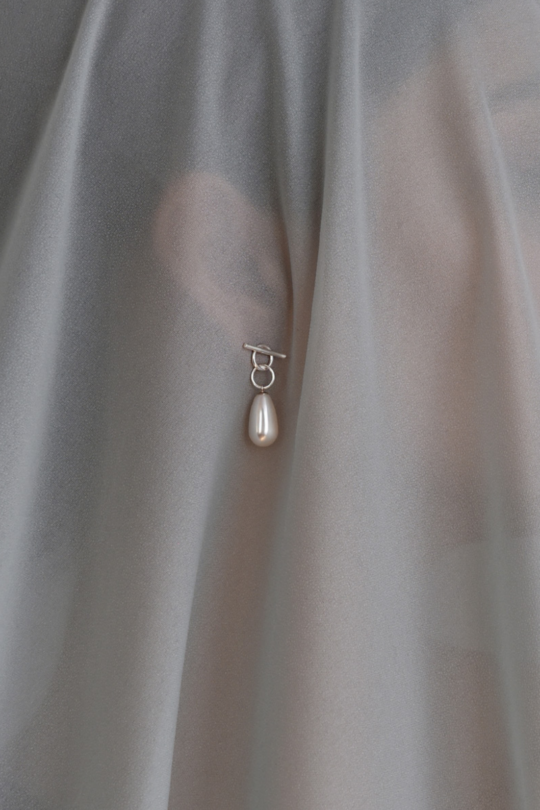
Two Way Tangle Earrings - White crystal pearl, sterling silver