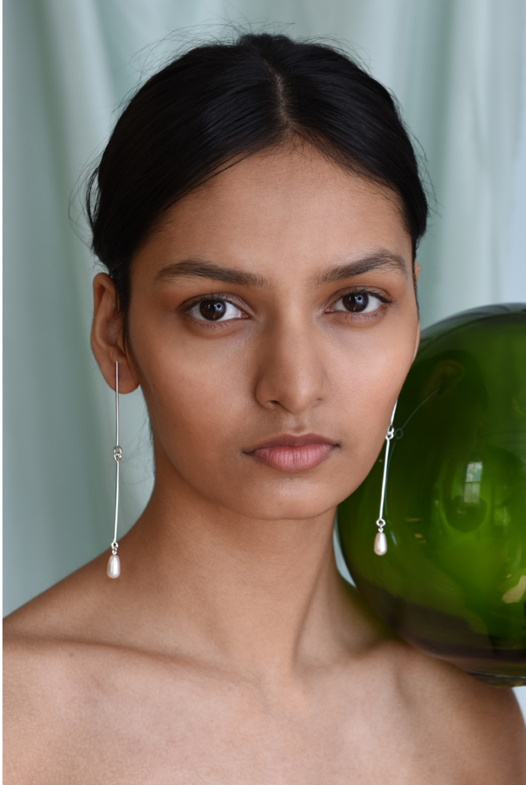
Pendulum Earrings - White crystal pearls, sterling silver. Prev page: Lineage Chain Collar - Sterling silver