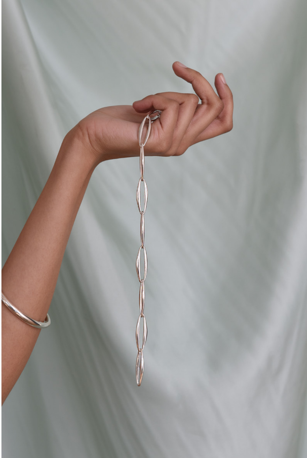
Lineage Chain Collar - Sterling silver. Prev page: Lineage Chain Bracelet - Sterling silver