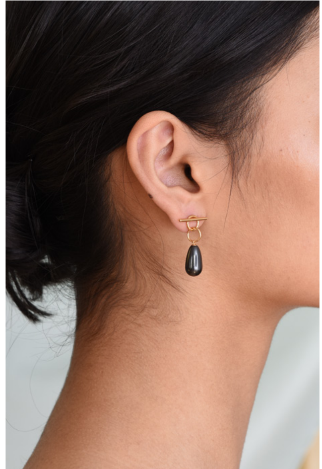
Two Way Tangle Earrings - Grey crystal pearl, sterling silver. Two Way Tangle Earrings - Grey crystal pearl, gold vermeil