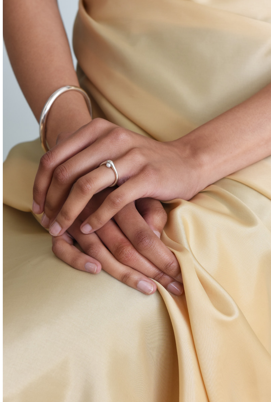
Peering Pearl Ring - Freshwater pearl, sterling silver, Peering Pearl Bangle - Freshwater pearl, sterling silver