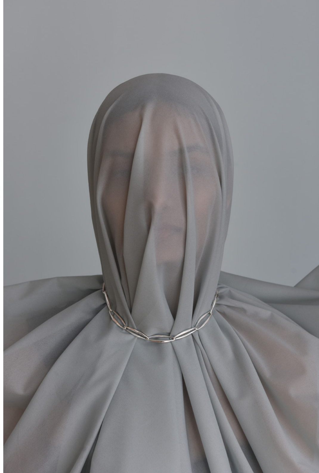
Lineage Chain Collar - Sterling silver