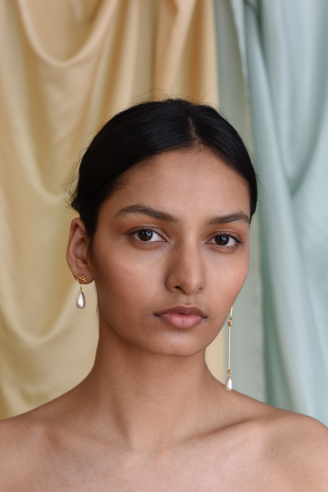
Two Way Tangle Earrings - White crystal pearl, gold vermeil. Pendulum Earrings - White crystal pearl, gold vermeil