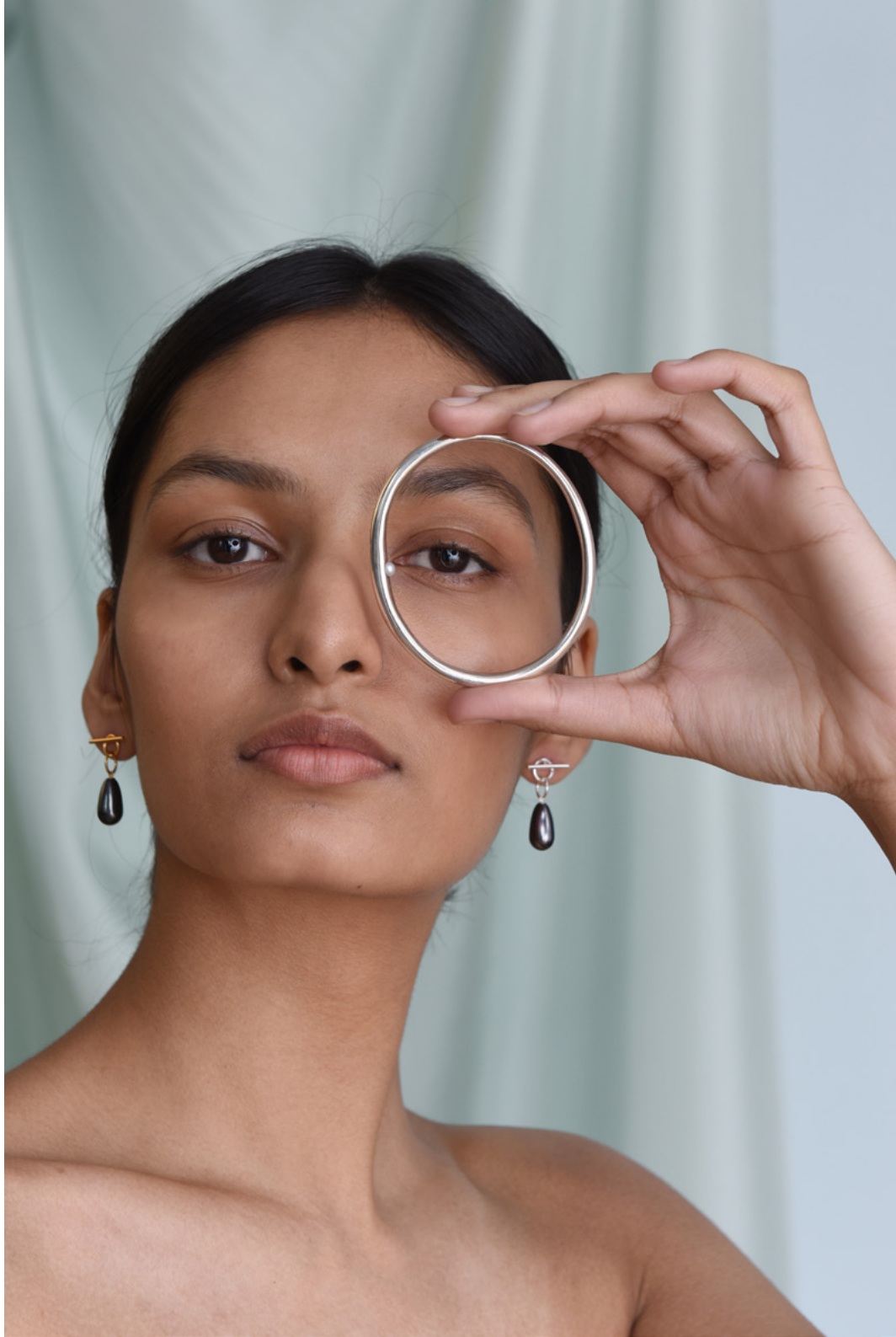
Peering Pearl Bangle - Freshwater pearl, sterling silver, Two Way Tangle Earrings - Grey crystal pearl, sterling silver, Two Way Tangle Earrings - Grey crystal pearl, gold vermeil