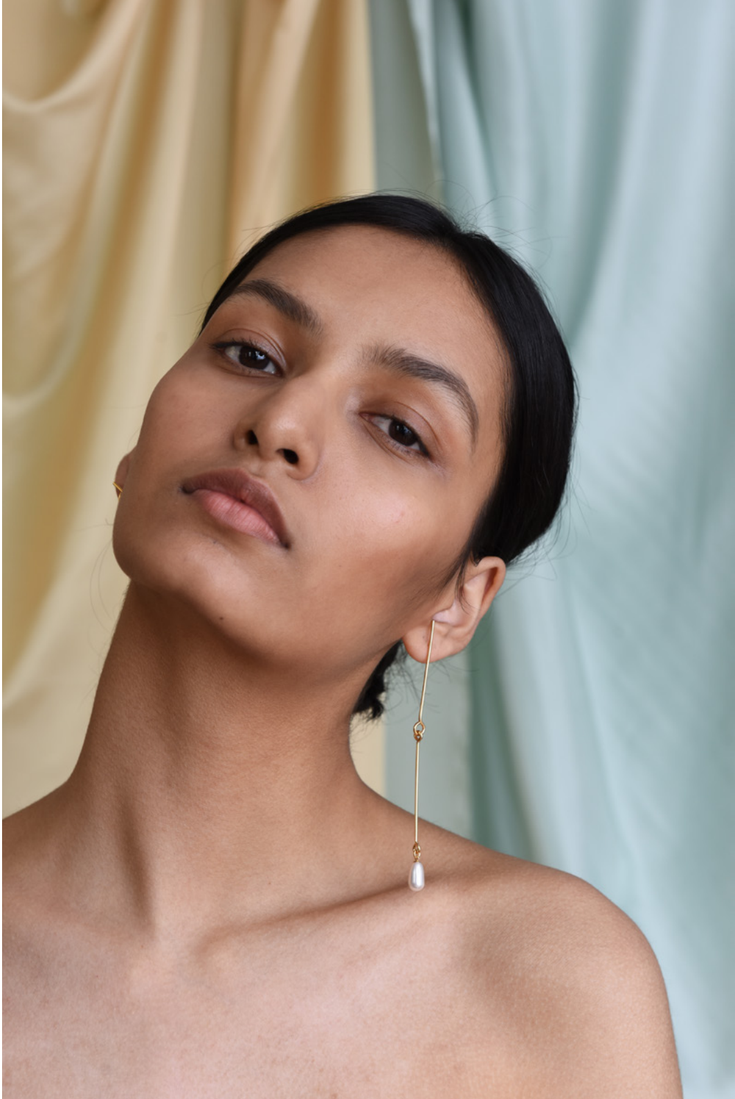
Pendulum Earrings - White crystal pearl, gold vermeil