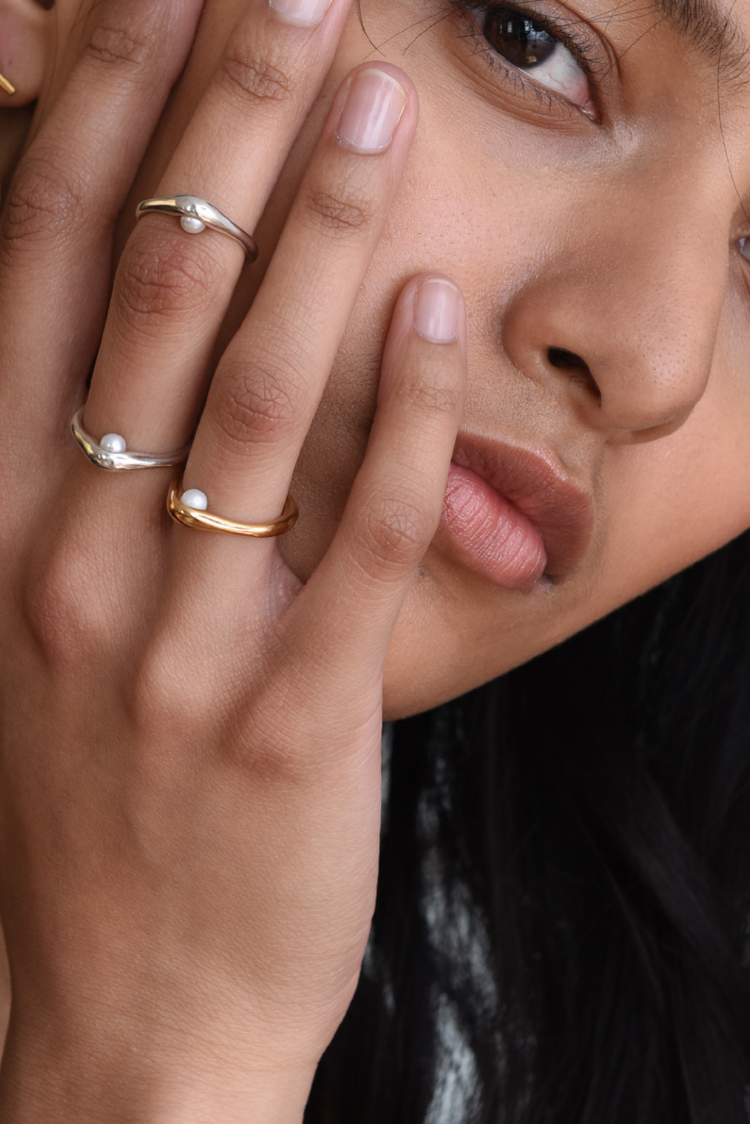
Peering Pearl Rings - Freshwater pearl, sterling silver and 9ct yellow gold