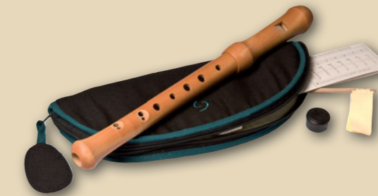
Soprano in c''