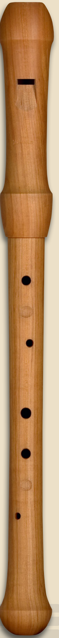
Penta Tenor in d'' seven-tonic

As with the two-piece soprano recorder, its headjoint can also be combined with a tenor body in c'.