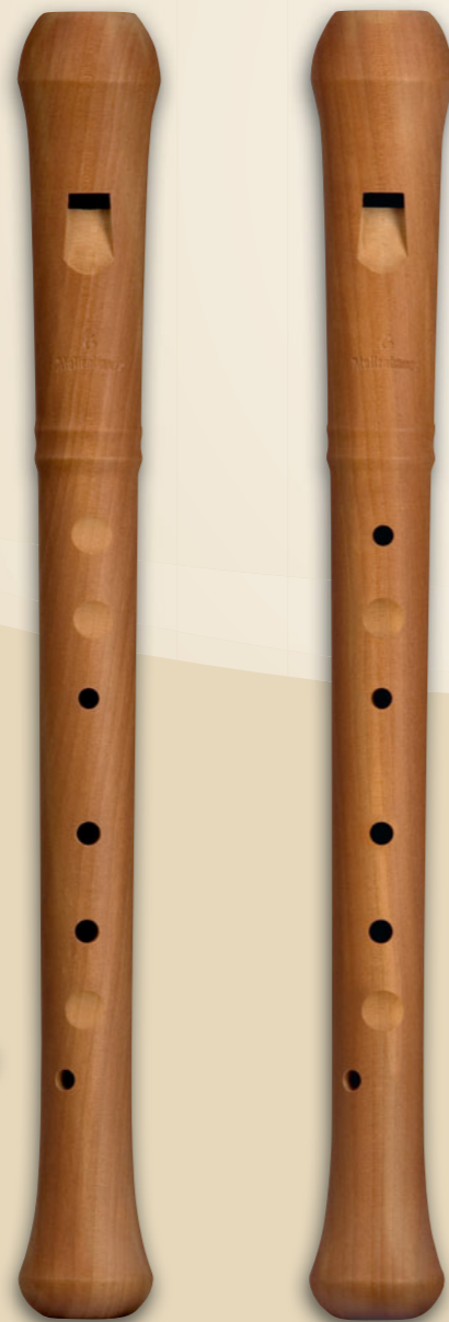
Bäumling in d'' pentatonic