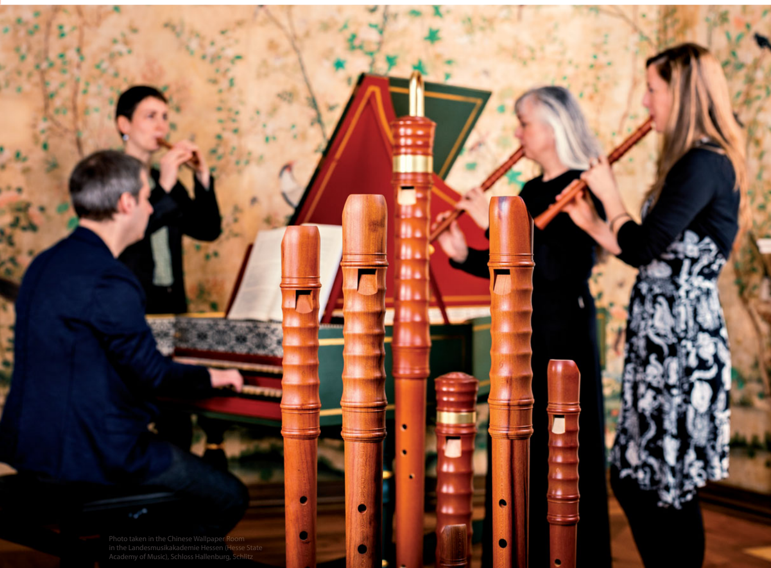
Photo taken in the Chinese Wallpaper Room in the Landesmusikakademie Hessen (Hesse State Academy of Music), Schloss Hallenburg, Schlitz

Completely revised – a new design – ranging from Garklein to Great bass