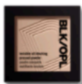
Black Opal Invisible Oil Blocking Powder