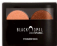
Black Opal Color Splurge Eye Satin Matte in Crème Brulee