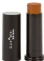
Black Opal True Stick Foundation in Suede Mocha

Here are the other products that were used to complete Solan look: