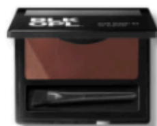
Black Opal Color Splurge Brow Shaper Kit