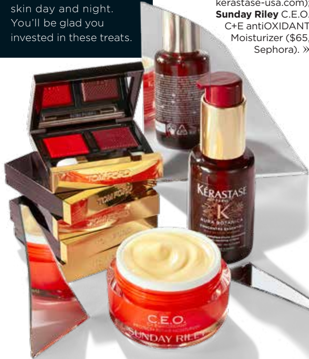
SHAHIDI