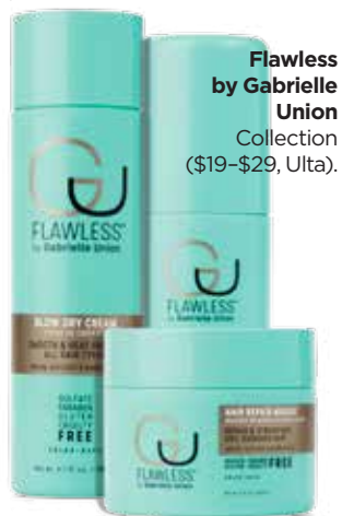
Flawless by Gabrielle Union Collection ($19–$29, Ulta).

Her hair is always laid and splayed, so we’re thrilled the actress has debuted a signature hair care collection. All ten products are filled with a blend of marula, argan and avocado oils, and under $30 each!