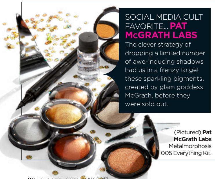
(Pictured) Pat McGrath Labs Metamorphosis 005 Everything Kit.

The clever strategy of dropping a limited number of awe-inducing shadows had us in a frenzy to get these sparkling pigments, created by glam goddess McGrath, before they were sold out.