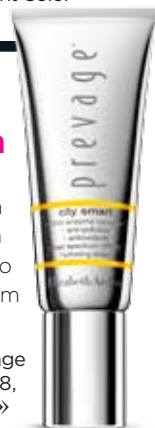
KEYS