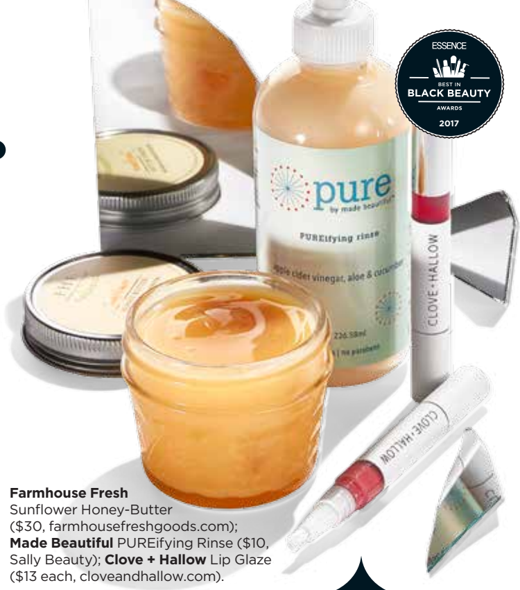
Farmhouse Fresh Sunflower Honey-Butter ($30, farmhousefreshgoods.com); Made Beautiful PUREifying Rinse ($10, Sally Beauty); Clove + Hallow Lip Glaze ($13 each, cloveandhallow.com).

If you want curly or straight dos, wigs or weaves, this brand has it. Using its 100 percent virgin human hair, you can get a natural look without any fuss.