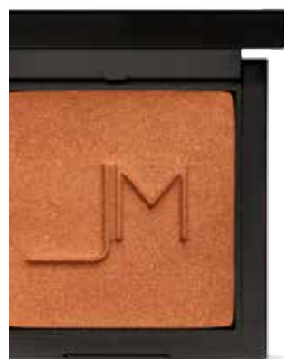
Jay Manuel Beauty Filter Finish 3D Illuminator in Paparazzi ($30, hsn.com).

On a quest for an illuminator that won’t leave your brown skin looking ashy? This gold-tinted powder is pure perfection for even the deepest of skin tones.