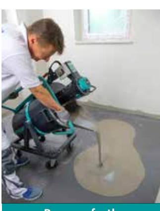
\cdot Pour perfectly \cdot