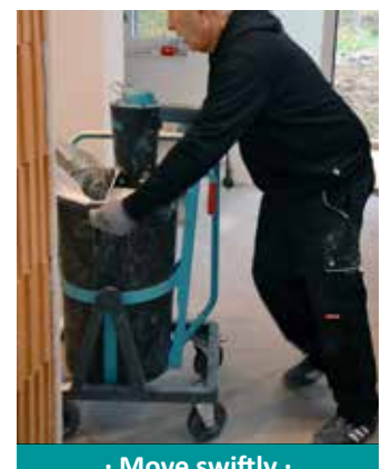
• Move swiftly •