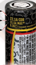
cell = battery; amperage = discharge