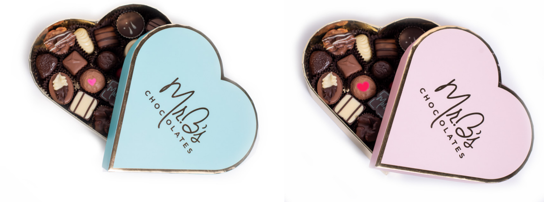
19 PIECE HEART VARIETY BOX