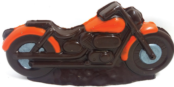
LARGE MOTORCYCLE HOLLOW 4.3 oz 7609

The sassy, high-heeled shopper and the can't-stop, won't-stop sports enthusiast will both feel seen with Mr. B's. We bring your customers' interests to life in chocolate.