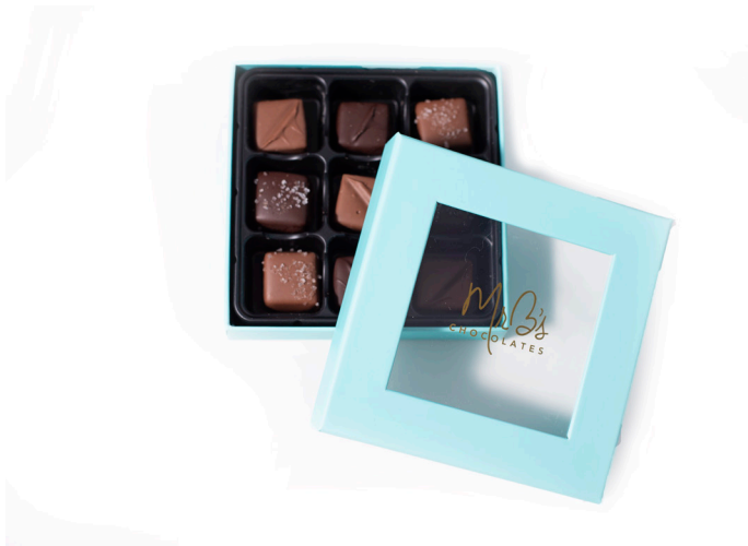
SEA SALT CARAMEL 9 PC 7654

Our Mr. B's specialty gold label boxes are a popular choice for premium belgium chocolates that add an exclusive look.