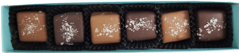
SEA SALT CARAMEL SLEEVE 6 PC 7647