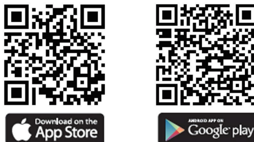
Figure 2: QR Codes