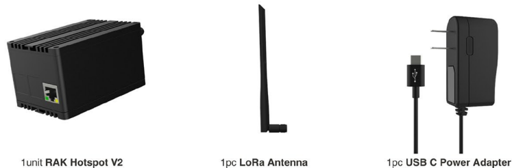
Figure 1: Package Contents