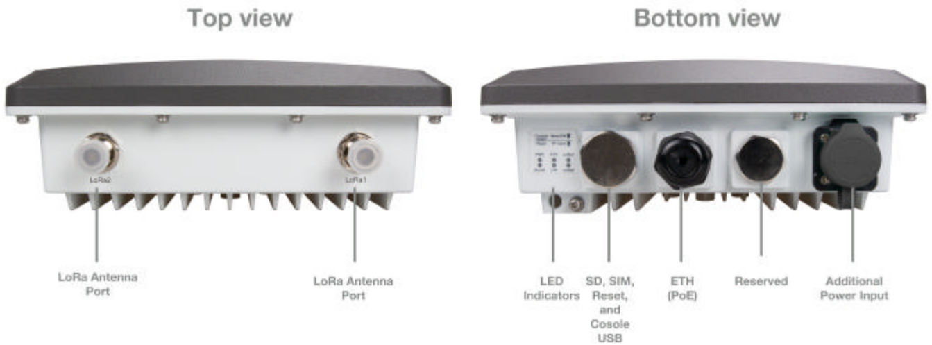
Figure 2: RAK7289 WisGate Edge Pro Interfaces