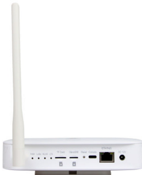
Figure 2: WisGate Edge Lite 2 Interfaces

The hardware interfaces of RAK7268 gateway include DC 12 V, ETH interface, Console interface, Reset key, TF Card slot, Status indicator LEDs, LoRa Antenna connector, etc.