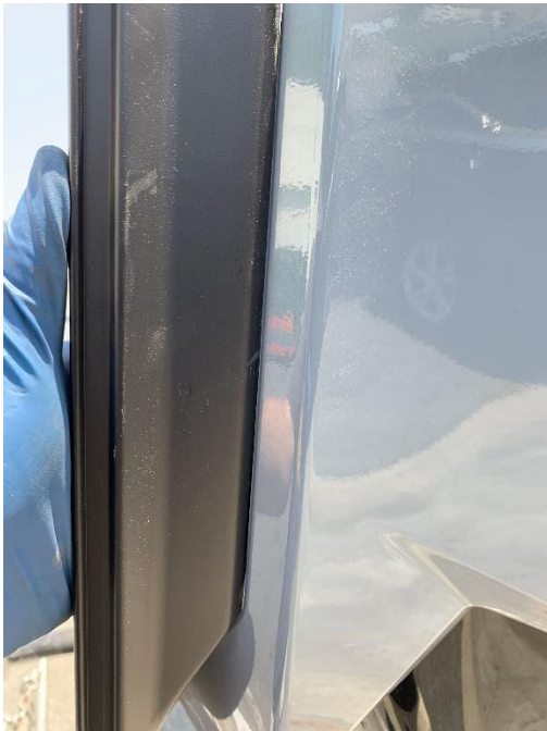
Figure 2LEFT SIDE