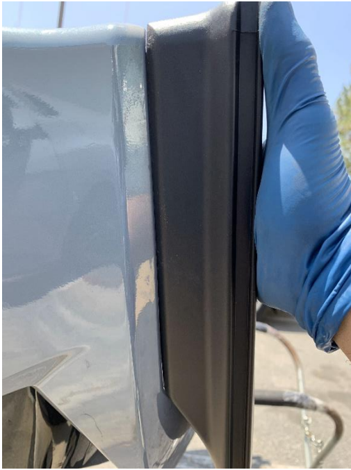
Figure 1 RIGTH SIDE

8.- Line up the side edge of the diffuser to the bumper. Then drill two holes by using the stock bumper as guide. You can either reuse the stock push in taps or use our supply bolts and nuts to secure it. Both can be use.