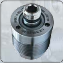
Precision Locators & Workholding Fasteners