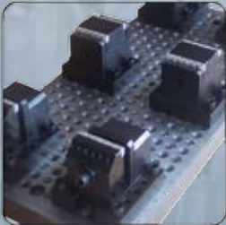
Modular Fixtures, Vises & Tooling Components