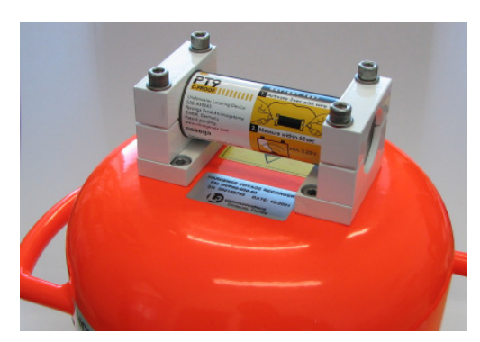
Figure 4: Final position of the PT9

Finally, the two mounting brackets have to be fixed with the internal PT9 C-PROOF, as shown in figure 4. The four kept screws will be useful to fix the mounting brackets. The screws are to be tightened with a turning moment of 8.4 Nm (75 in/lbs).