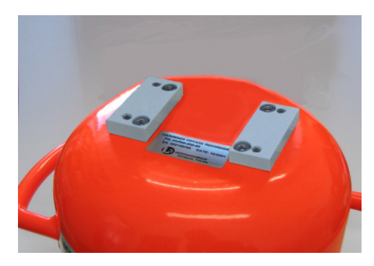
Figure 3: Fixed position

For the final assembly the two plates are to be fixed in position, as shown in figure 3, with the four included cylinder head screws 1/4"-20 UNC x 3/8". For an optimal purchase, the screws are to be tightened with a turning moment of 8.4 Nm (75 in/lbs).