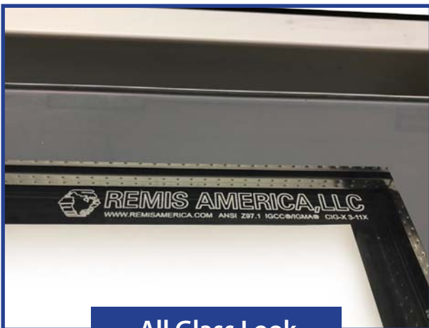
All Glass Look