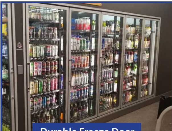
Durable Freeze Door