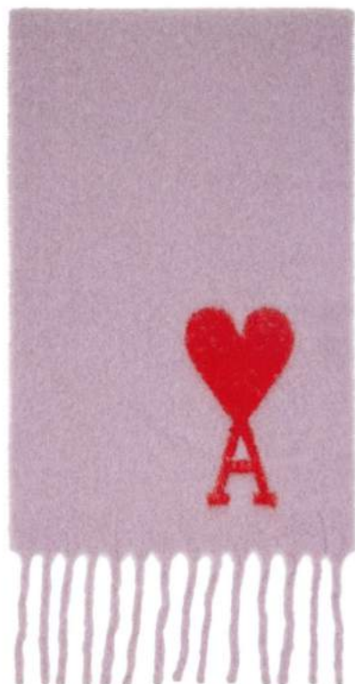
AMI ALEXANDRE MATTIUSI Purple Oversized Arts De Coeur Scarf, $200, SHOP NOW