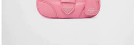
Prada Moon padded zipper-leather bag, $2,950, SHOP NOW