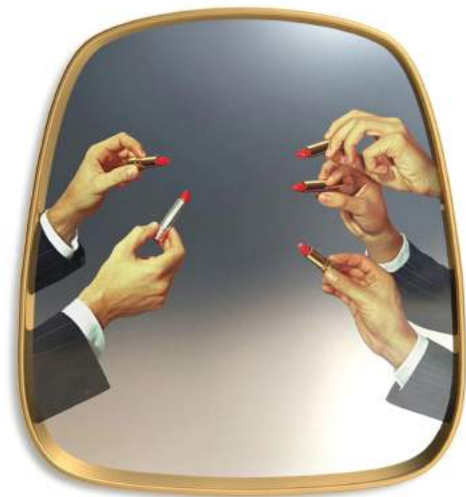
Salotti Lupatella Toilet Paper Mirror, $470, SHOP NOW