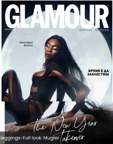
Fitted bodysuit and leggings-Full look: Mugler takeover