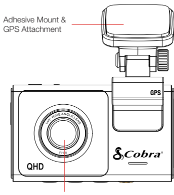
Front View Camera Lens