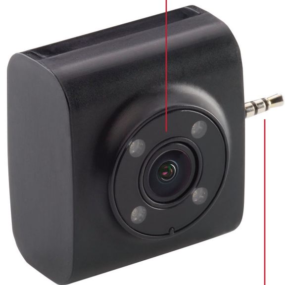
Video Input Jack