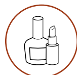
Nail Polish, Lipstick