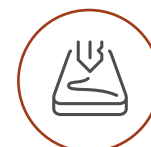
Deep Scratches, Gouges