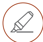
Pen, Ink, Marker