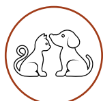
Pet Bodily Fluids