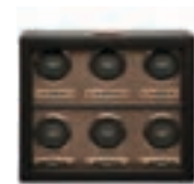
AXIS 6PC WINDER COPPER