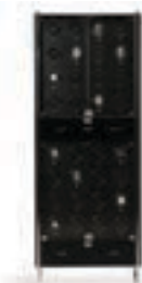
32PC WINDER CABINET PIANO BLACK / MATTE BLACK