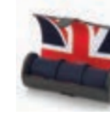
UNION JACK TRIPLE WATCH ROLL