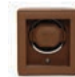
CUB WINDER WITH COVER COGNAC