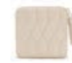
CAROLINE TRAVEL ZIP CASE ROSE QUARTZ