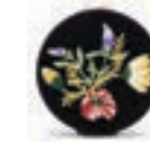
ZOE TRAVEL ROUND INDIGO