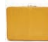
MARIA LARGE ZIP MUSTARD