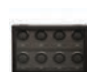
AXIS 8PC WINDER POWDER COAT