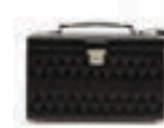
CAROLINE LARGE CASE IVORY