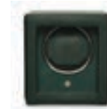
CUB WINDER WITH COVER GREEN