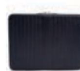
MARIA LARGE ZIP NAVY