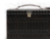
CAROLINE ARMOIRE IVORY