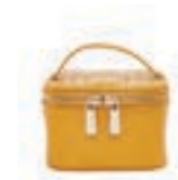
MARIA SMALL CUBE MUSTARD