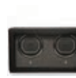
CUB DOUBLE WINDER WITH COVER BLACK