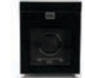
SAVOY SINGLE WINDER WITH STORAGE BLACK