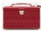
CAROLINE LARGE CASE BLACK