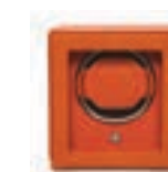
CUB WINDER WITH COVER ORANGE