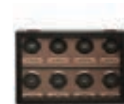
AXIS 8PC WINDER COPPER