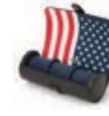
US FLAG TRIPLE WATCH ROLL