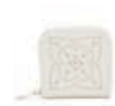
MARRAKESH TRAVEL ZIP CASE CREAM