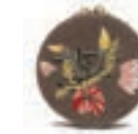
ZOE TRAVEL ROUND MINK