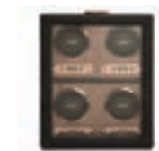
AXIS 4PC WINDER COPPER