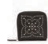
MARRAKESH TRAVEL ZIP CASE BLACK