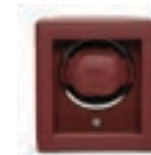
CUB WINDER WITH COVER BORDEAUX