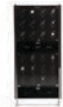
24PC WINDER CABINET PIANO BLACK / MATTE BLACK