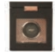
AXIS SINGLE WINDER WITH STORAGE COPPER