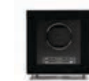
SAVOY SINGLE WINDER BLACK