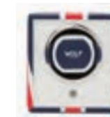
UNION JACK WINDER