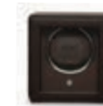
CUB WINDER WITH COVER BROWN