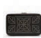
MARRAKESH ZIP CASE BLACK