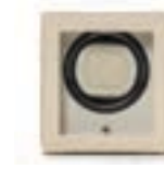
CUB WINDER WITH COVER CREAM