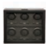
AXIS 6PC WINDER POWDER COAT