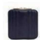
MARIA SMALL ZIP NAVY