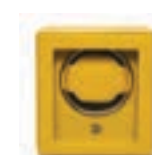
CUB WINDER WITH COVER YELLOW