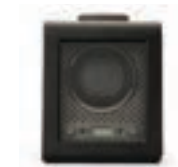
AXIS SINGLE WINDER POWDER COAT