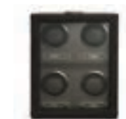
AXIS 4PC WINDER POWDER COAT