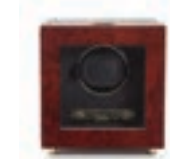
SAVOY SINGLE WINDER BURLWOOD