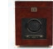
SAVOY SINGLE WINDER WITH STORAGE BURLWOOD