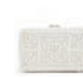
MARRAKESH ZIP CASE CREAM