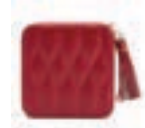
CAROLINE TRAVEL ZIP CASE BLACK