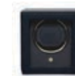
CUB WINDER WITH COVER NAVY