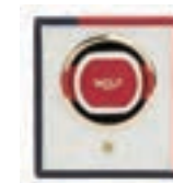
US FLAG WINDER