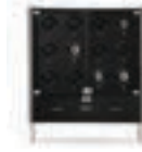
12PC WINDER CABINET PIANO BLACK / MATTE BLACK