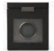
AXIS SINGLE WINDER WITH STORAGE POWDER COAT