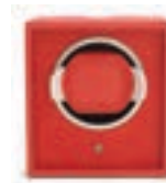
SWISS FLAG WINDER