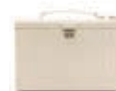
CAROLINE ARMOIRE ROSE QUARTZ