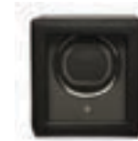
CUB WINDER WITH COVER BLACK

10" L X 6" W X 5.75" H 26CM L X 15.4CM W X 14.8CM H 2 winding modules ITEM NO: 4612