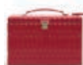
CAROLINE ARMOIRE BLACK