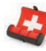
SWISS FLAG TRIPLE WATCH ROLL