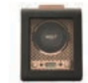
AXIS SINGLE WINDER COPPER

20.5" L X 6.5" W X 13.25" H 52CM L X 16CM W X 34CM H 8 winding modules ITEM NO: 4697