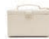
CAROLINE LARGE CASE ROSE QUARTZ