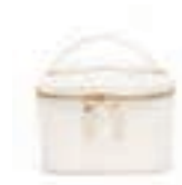
MARIA SMALL CUBE WHITE