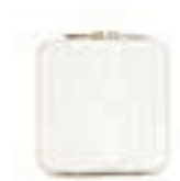
MARIA SMALL ZIP WHITE