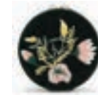
ZOE TRAVEL ROUND FOREST GREEN

13.25"L X 9.25"W X 9.25"H 33.6CM L X 23.5CM W X 23.5CM H 20 compartments, 18 ring rolls, 12 snap-on necklace hooks, 5 bracelet compartments, 6 bracelet/watch cuff compartments, mini travel case ITEM NO: 3930