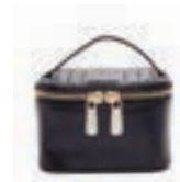
MARIA SMALL CUBE NAVY

10"L X 7.5"W X 2.5"H 26CM L X 20CM W X 6.4CM H 10 ring rolls, 2 compartments, 1 lidded compartment, 2 drawstring pouches, 6 necklace snap-on hooks with pocket, 1 ring bar, 1 earring bar. ITEM NO: 7661