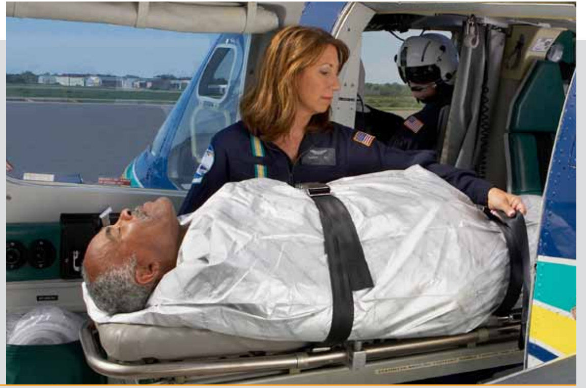
Thermoflect<sup>®</sup> Adult Transport Cocoon

Thermoflect<sup>®</sup> does not interfere X-ray or CT scan images. The ultra light weight material is lined with a soft inner surface, for optimal comfort of your patient. There are no special waste disposal requirements for Thermoflect<sup>®</sup>.