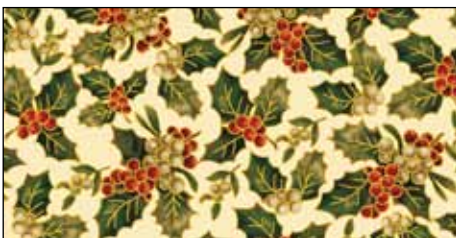
CMEM 275 MU*