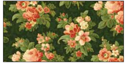
CMEM 272 G*