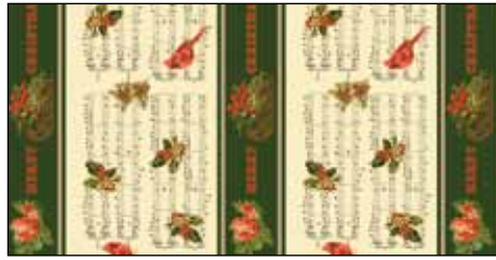
CMEM 271 MU