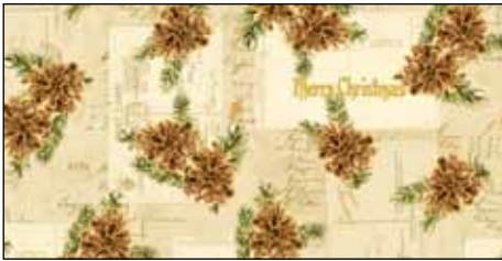
CMEM 273 NE