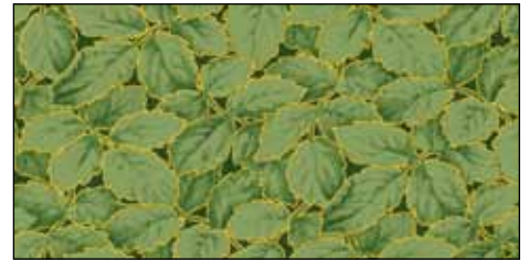
CMEM 274 G