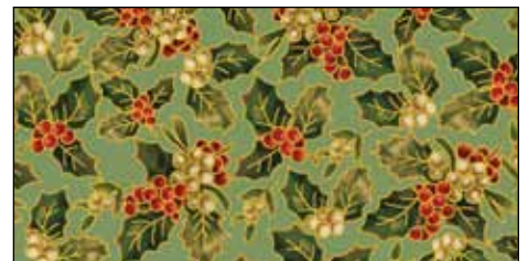
CMEM 275 G