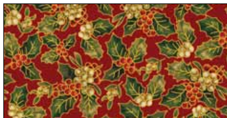
CMEM 275 R