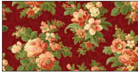
CMEM 272 R