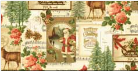
CMEM 270 MU*