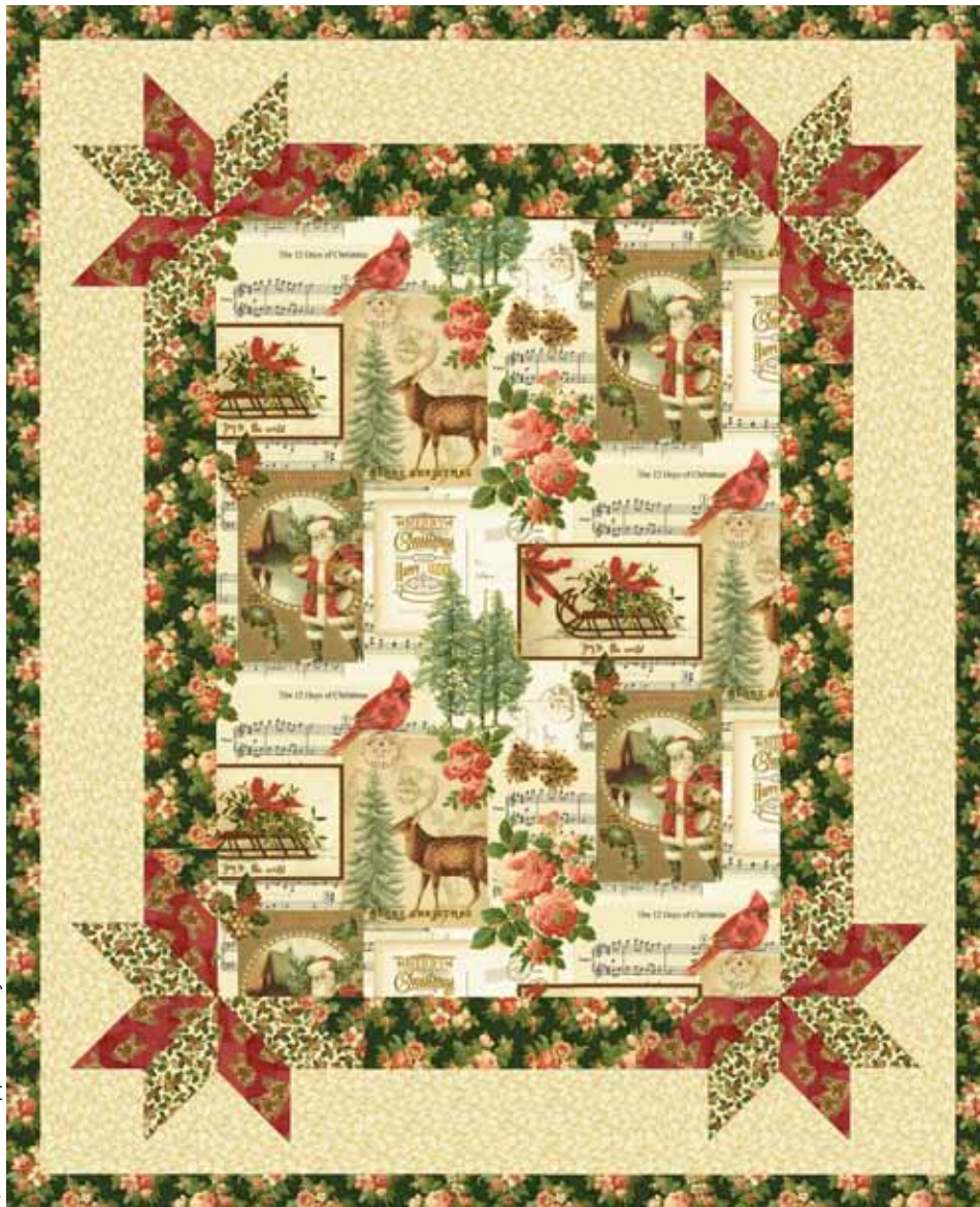
Quilt size: approximately 53½" x 65½"

Fabric collection by Sara Morgan Original quilt design by eQuilter; reimaged by Leslie Sonkin