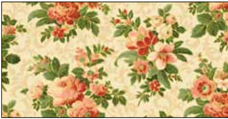
CMEM 272 MU†