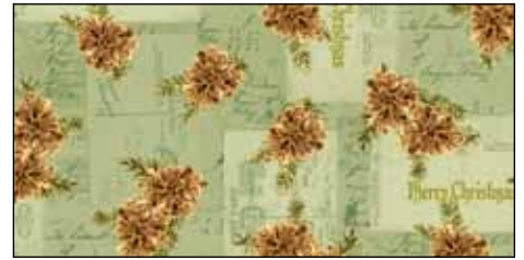
CMEM 273 G