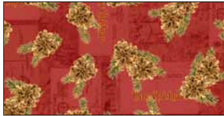
CMEM 273 R*