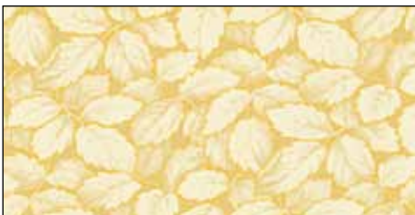
CMEM 274 NE*