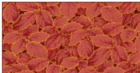
CMEM 274 R