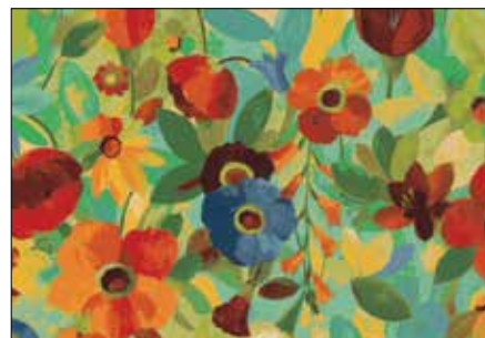
SIL2 777 MU