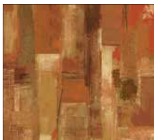
SIL2 775 I