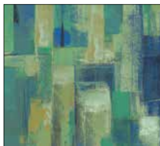
SIL2 775 T