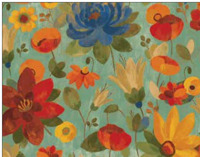
SIL2 771 T