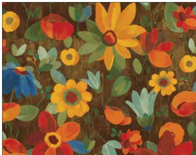
SIL2 771 Z