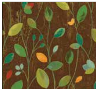
SIL2 773 Z