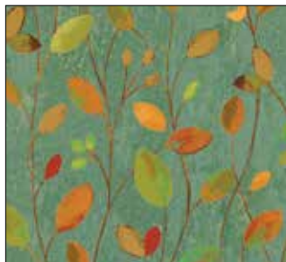
SIL2 773 T