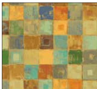
SIL2 776 AU