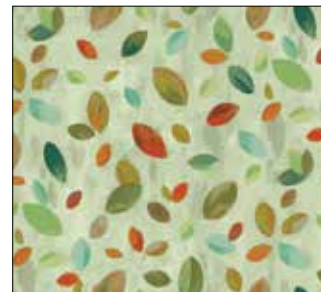
SIL2 774 M