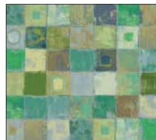
SIL2 776 T