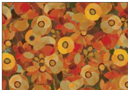
SIL2 772 I