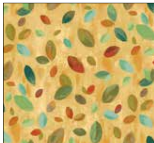
SIL2 774 AU