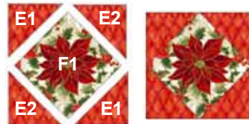
Figure 1 Make 22.