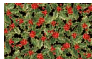
REJO 4165 MU