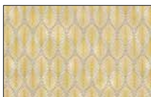
REJO 4166 E