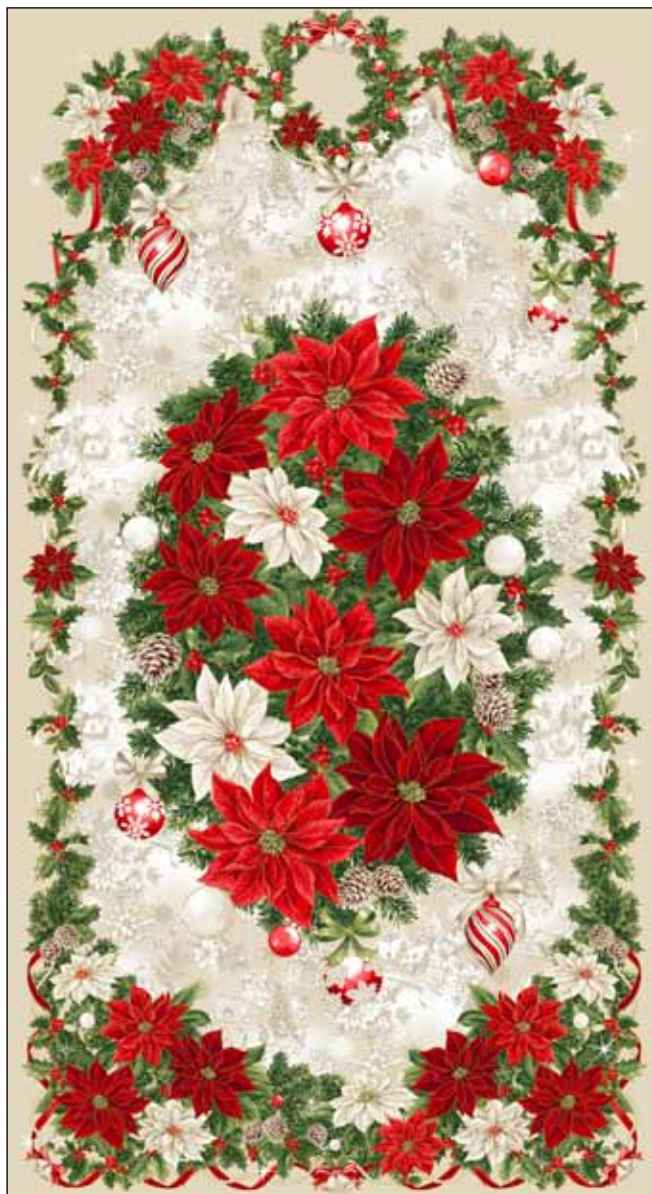
REJO 4161 MU* (rotated)