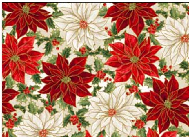
REJO 4162 R*†