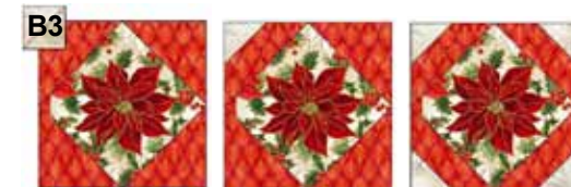
Figure 2 Make 22.