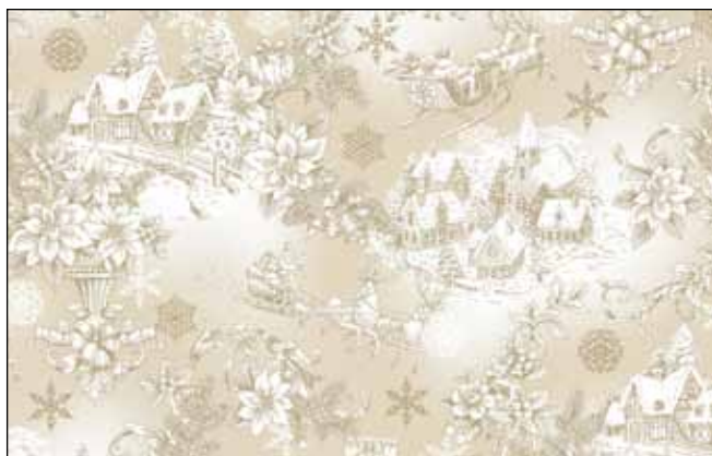
REJO 4163 E*