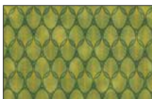
REJO 4166 G*