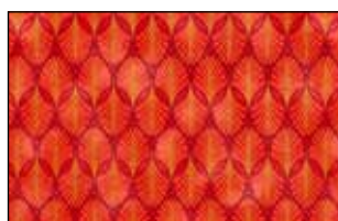
REJO 4166 R*