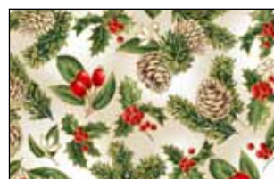
REJO 4164 MU*