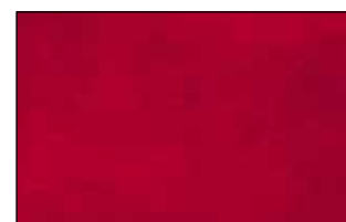
SUE6 302 R*