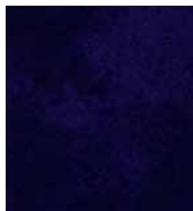
SUED 300 N*