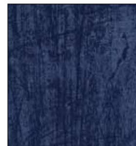
TERR 247 DN*