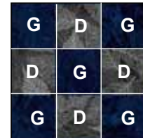
BLOCK 6 Make 2