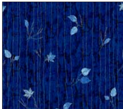
MIWO 4349 DB*