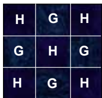
BLOCK 1 Make 4