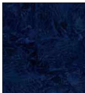
FRAC 4123 N*