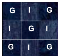
BLOCK 2 Make 2