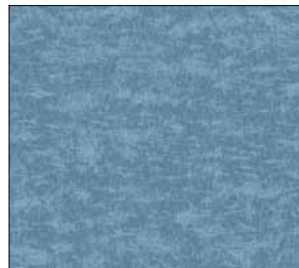
MIWO 4351 B*