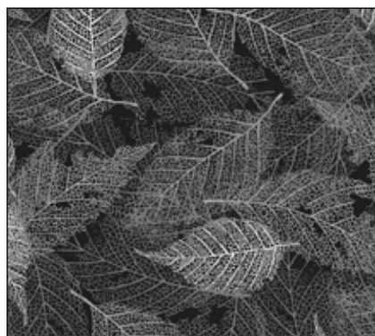
MIWO 4350 S*