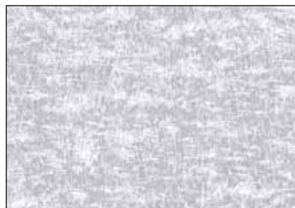
MIWO 4351 LS*