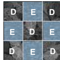
BLOCK 5 Make 2