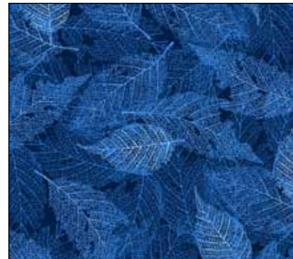
MIWO 4350 B*†