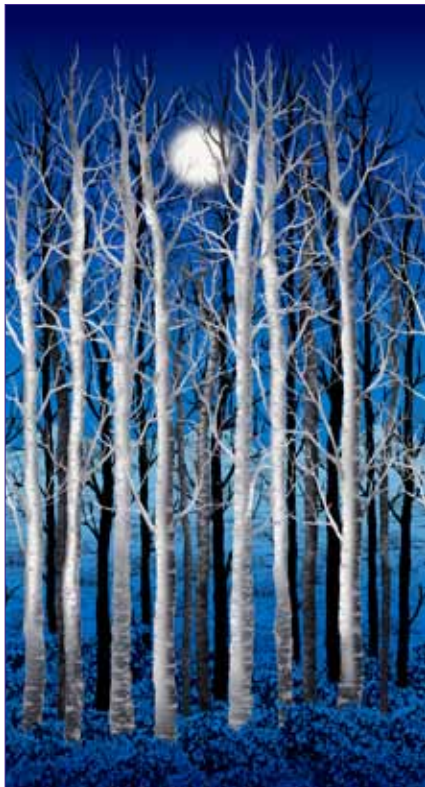
MIWO 4348 PA*